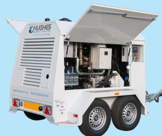
End panels remove with two screws